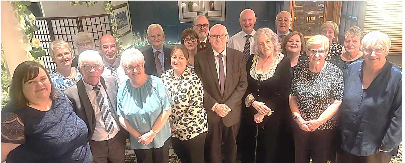
Attendees at the Western Isles Lieutenancy 2024 AGM in Barra

SEPTEMBER 11TH LIEUTENANCY 2024 AGM IN BARRA This year's AGM and annual dinner was held in the Heathbank Hotel in Barra. The weather was favourable which meant travel arrangements were straightforward.