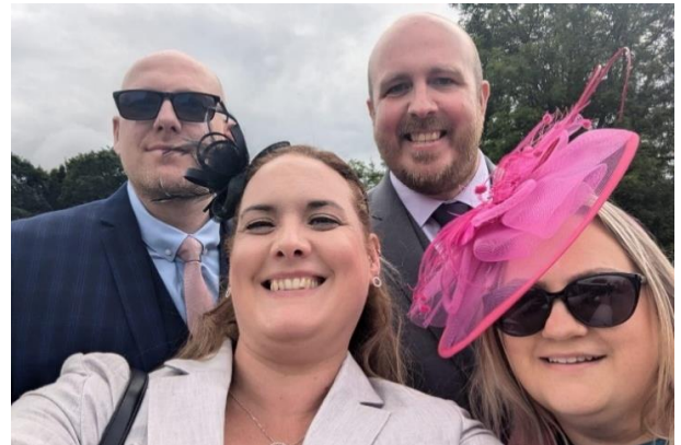
South Uist attendees at the Garden Party