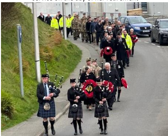
Tarbert, Isle of Harris