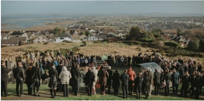
Remembrance Service at the Lewis War Memorial in Stornoway, Isle of Lewis

This year I attended the Remembrance service at St Columba's Pargh Church, followed by the normal parade and salute by the Lord-Lieutenant at Càrn Gardens in Stornoway, prior to the service at the Lewis War Memorial, where a large crowd attended.