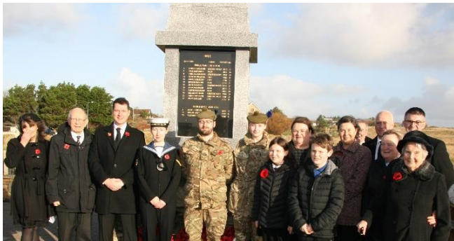
Barvas and Brue