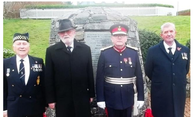
Melbost and Branahuie