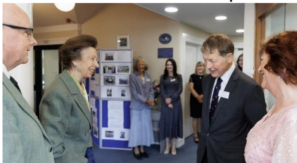
Aros an Rubha