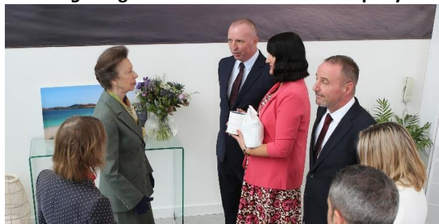
Carloway Community Centre